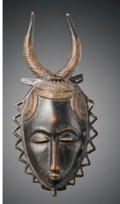
ABOVE: Mask, tu bodu . Yaure, Côte d'Ivoire.