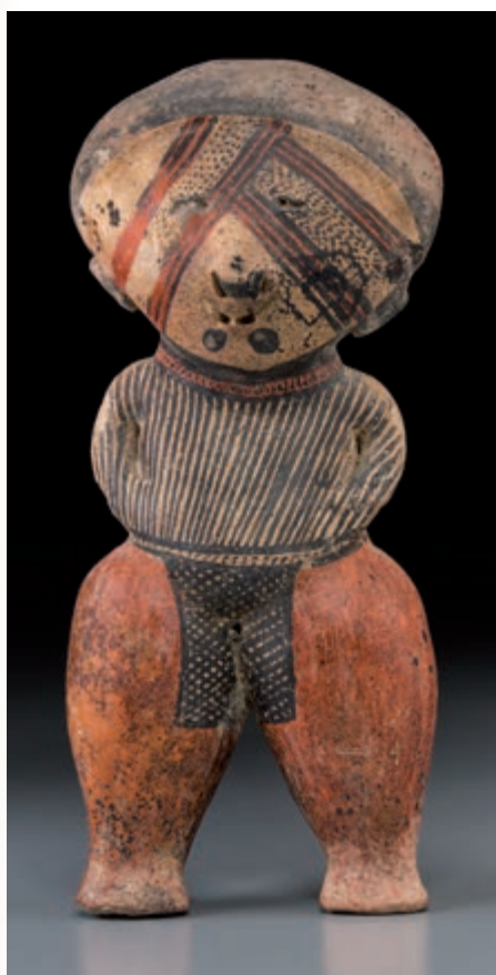
LEFT: Chinesco standing figure. Nayarit, West Mexico. C. 200 BC–AD 200.

Wood. H: 43.5 cm. Ex Bernd Muhlack, Kiel; Walter Schmidt, Igls/Innsbruck. To be offered by Zemanek-Münster on May 27, 2017, est. 4,500–9,000 euros.