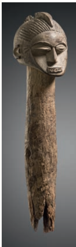
ABOVE: Sculpted head. Lobi, Burkina Faso.

Parcours des Mondes Saint Germain-des-Prés, Paris www.parcours-des-mondes.com